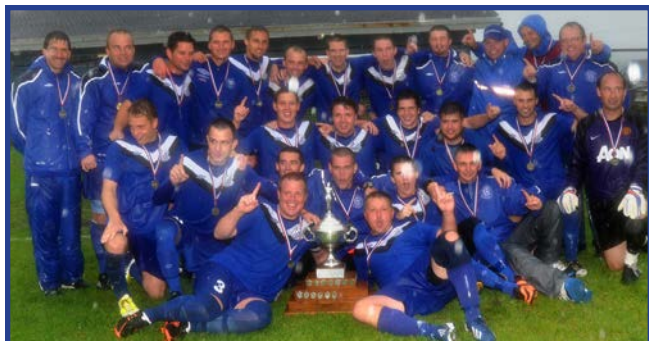
2013 Provincial Challenge Cup Champions

Learn about our history and the heroic efforts of our citizens or treat yourself to an exciting game of soccer. The town of St. Lawrence has been acclaimed for its soccer excellence and has more provincial trophies and championships than any other town its size in Canada.